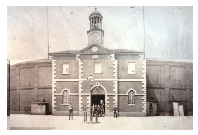
The trail begins close to the site of Huddersfield's Cloth Hall (pictured above) on Market Street at its junction with Cloth Hall Street. The site is now occupied by a Sainsbury's supermarket.

Parliament and the institutions of the state at this time were still the province of the aristocracy and the well-to-do. Having exhausted all the available peaceful ways of influencing the government, the Luddites resorted to violent direct action.