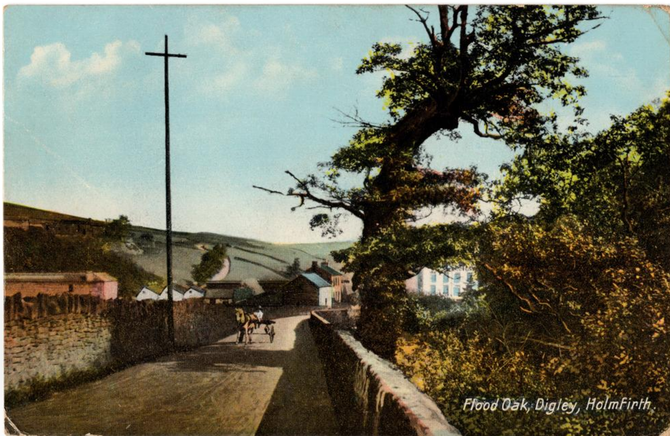
The "Flood Oak" at Digley which survived being washed away by the 1852 Holmfirth Flood.

We would like to hear from you! Please send any news, details of events and books, requests for information and comments that you think may be of interest to other Huddersfield Local History Society members to publications@huddersfieldhistory.org.uk