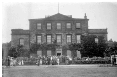
The Mansion, Crow Nest Park