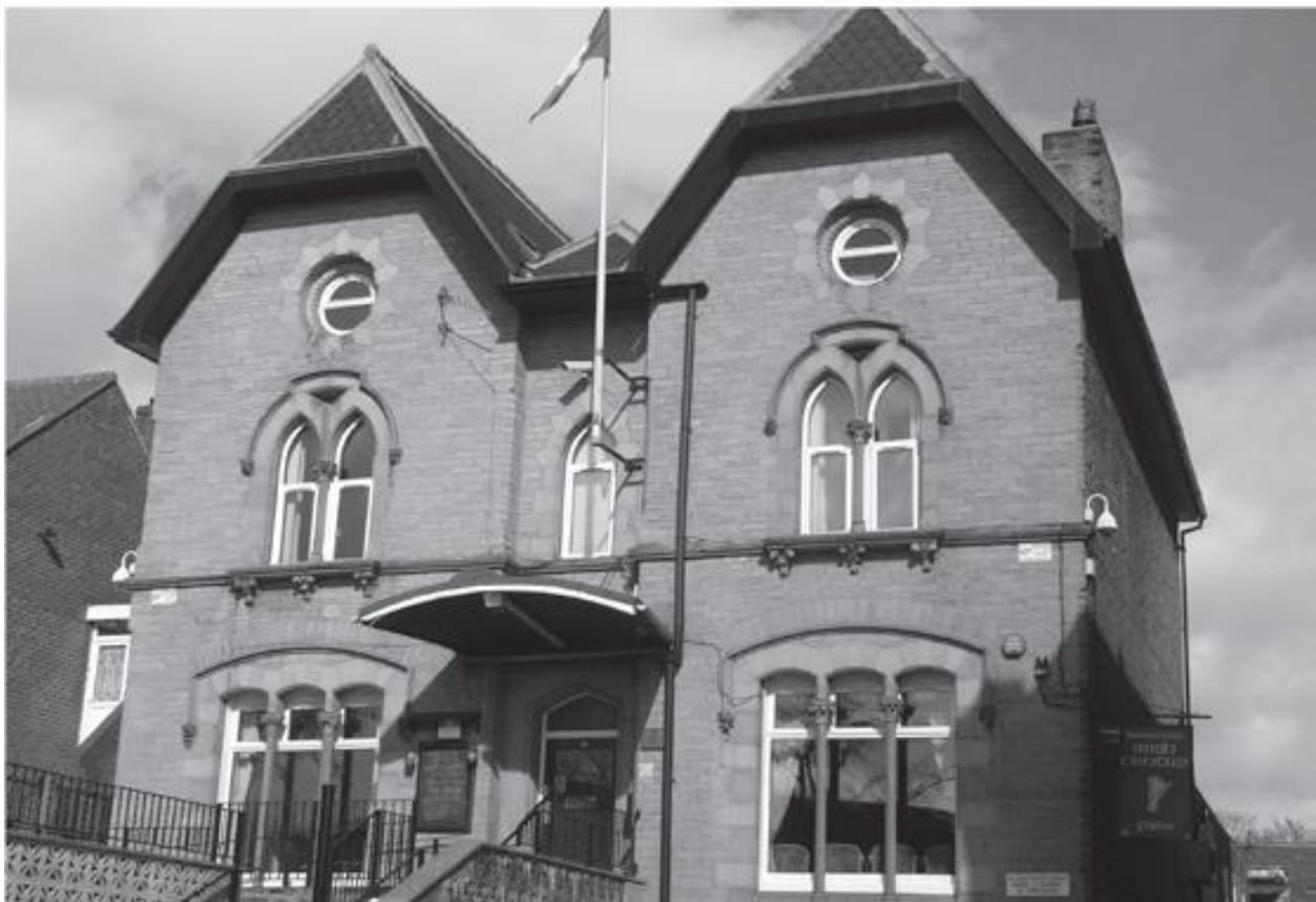
The Irish Centre, Fitzwilliam Street – see page 2

We would like to hear from you! Please send any news, details of events and books, requests for information and comments that you think may be of interest to other Huddersfield Local History Society members to publications@huddersfieldhistory.org.uk